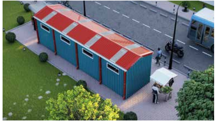
Multiple Kiosks_4 Partitions_3x12x3M