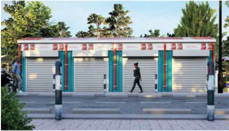
Multiple Kiosks_4 Partitions_3x12x3M