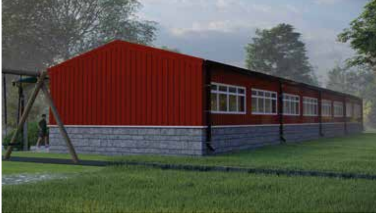
Classrooms_6x32x3M_4 Unit Block